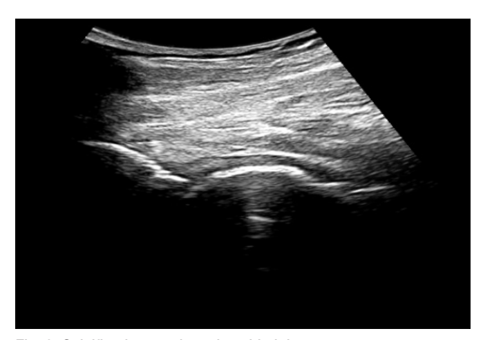
Fig. 2. Calcifications and erosions hip joint