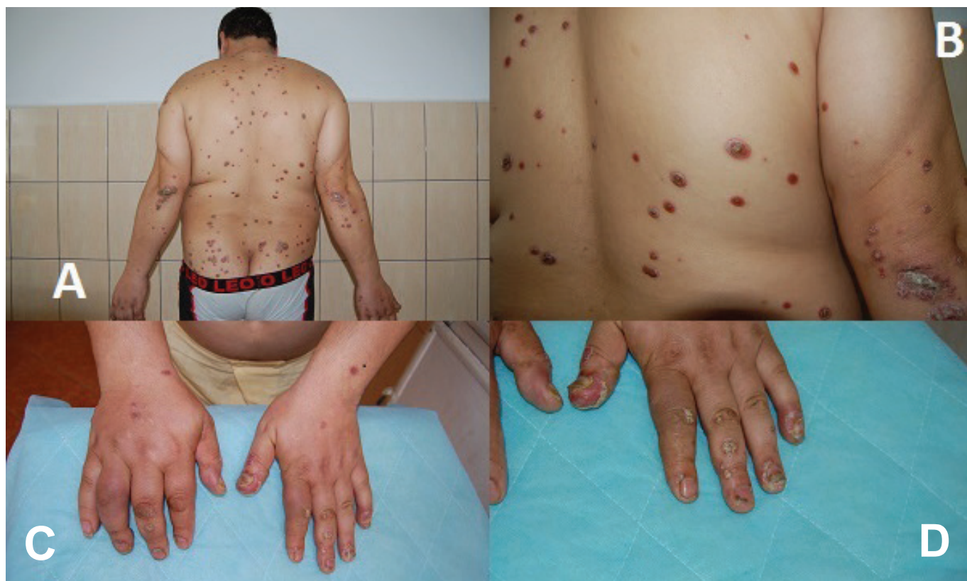
Fig. 1. Clinical aspects. A) Disseminated eruption of rupoid crusts B) Rupoid crust – detail C) Dactylitis D) Onycholysis