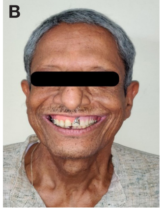
Fig. 6. (A) Preoperative (B) Postoperative (Smile of Confidence)

able. An obturator should have adequate support, retention, and stability to accomplish all these goals [14]. In the present case, support was provided for the prosthesis by the remaining teeth, the palate, and the rest. Rests were prepared on the right first premolar, second premolar, first molar, and second molar. Retention was achieved using a tripodal design with extra coronal retainer, by the alveolar ridge, residual soft palate by achieving posterior palatal seal, residual hard palate through undercuts, lateral scar band, and height of the lateral wall. Stability was achieved by providing bracing components on the palatal side and prosthesis extension in all lateral directions.