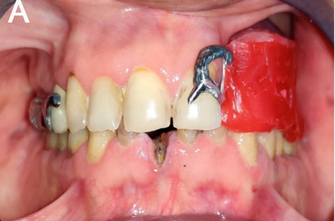
Fig. 3. (A) Jaw Relation (B) Try-in