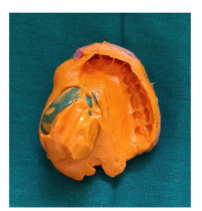
Fig. 1. Master Impression

Obturators should be comfortable, restore deglutition and mastication, phonetics, and be cosmetically accept-