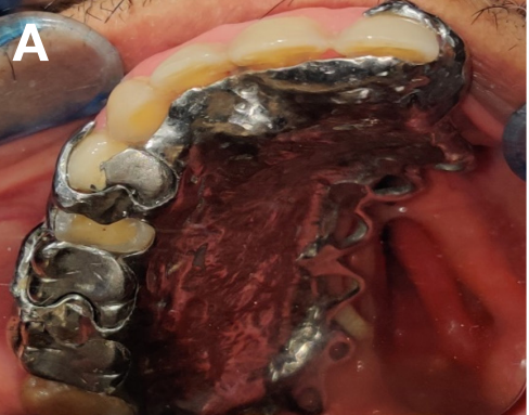
Fig. 2. A & B: Metal Framework Try-in