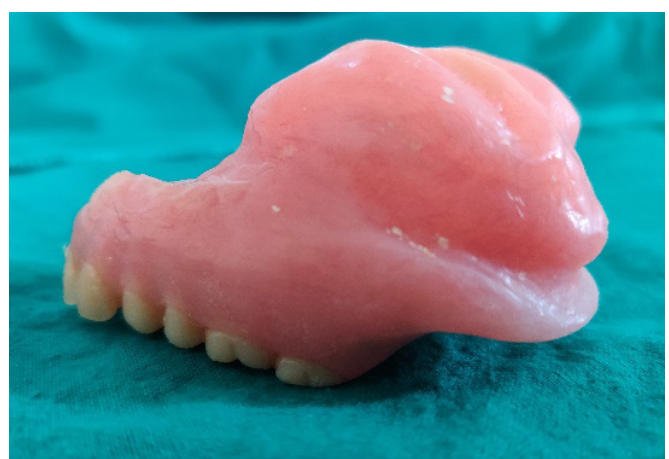
Fig. 4. Intaglio surface of the obturator with closed hollow bulb extension