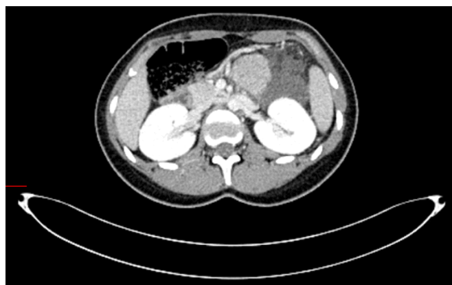
Fig. 4. Body and tail of pancreas are inhomogeneous, also there is intraabdominal fluid, and areas of necrosis.