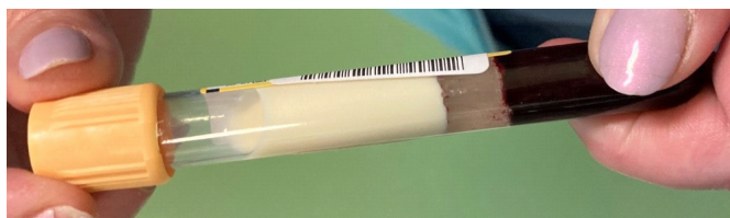
Fig. 1. Picture of intense lipemic serum, 21 years old female

Symptomatic treatment was administered: painkillers, spasmolytic medicine, and hydration with Ringer’s solution. Pain turned so intense that the patient needed administration of 50 µg opioid drug twice since admission. After having the laboratory tests and imaging, empirical intravenous antibiotic treatment with 1 gram of Ceftriaxone was initiated.