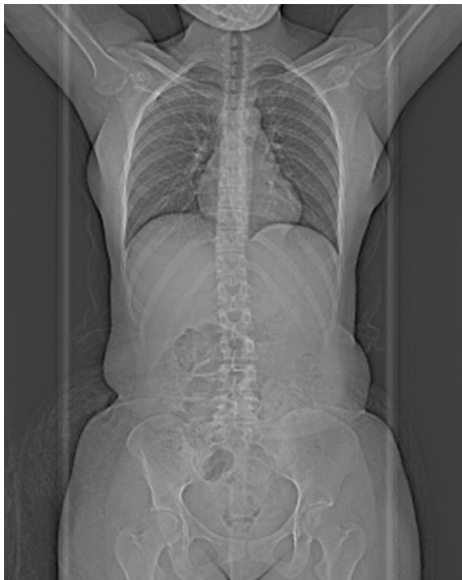
Fig. 2. CT scan of patient – notice her slender build

The patient was successfully admitted to the gastroenterology department and discharged four weeks later with an improved general state and laboratory tests under conservative treatment.