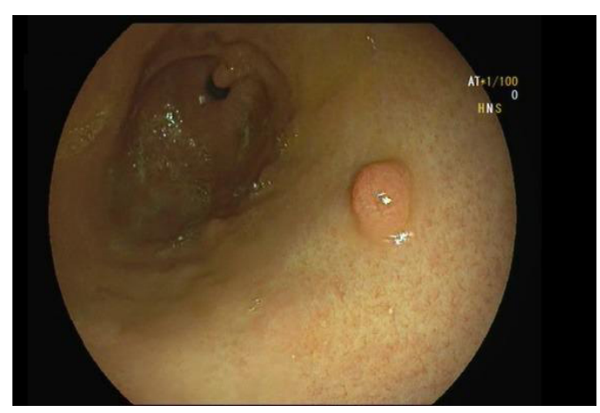
Fig. 2. Endoscopic aspect - corpus

ent level of experience to complete the questionnaire after assessment of 120 video-recordings. Some studies [11-13] reveal that experience leads to a higher degree of agreement, while other do not [14, 15]. There have been studies in which live endoscopic video-recordings were presented that could have improved the degree of agreement, but there is a study in which live endoscopic images were used and the degree of agreement was not significantly modified [16, 17].