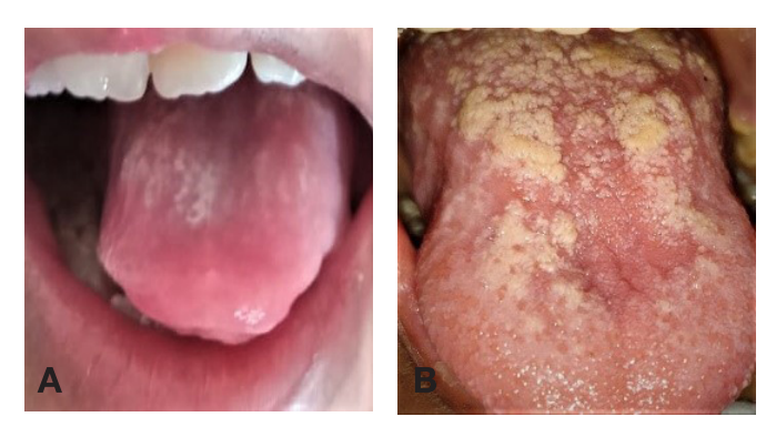
Fig. 1. A. Showing presence of widespread, homogenous, nonscrapable, curdy-white, plaque-like deposits on the dorsum of the tongue. B. Showing mild resolution of white lesions at five-week follow-up.

As a part of an interdisciplinary approach to provide treatment for patient, therapeutic diagnostic approach was followed with an integrated team, involving paediatrician, paediatric dentist and a specialist in oral medicine.