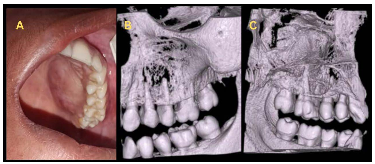
Fig. 3 (A) Intraoral dome shaped swelling (B, C) CBCT images showing multicystic hypodense lesions extending from 24 to 27 and involvement of maxillary sinus

Treatment involved surgical resection, tailored to disease extent. Radiotherapy was added in the second case due to lymph node involvement and maxillary sinus invasion. Literature indicates that treatment should account for tumor stage, extension, and metastasis, with mandatory long-term follow-up to monitor recurrence. Prognostic factors, such as tumor grade, cortical expansion, and lymph node involvement, are crucial [8]. Studies by de Souza et al. show that high-grade tumors are more aggressive, with a